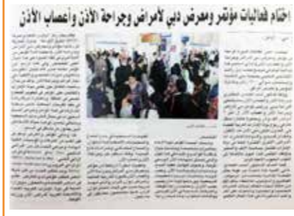
AL WATAN NEWSPAPER Dubai Otology 2016 – Day 3