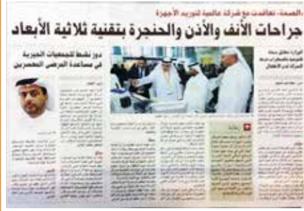
AL BAYAN NEWSPAPER Dubai Otology 2016 – Day 1