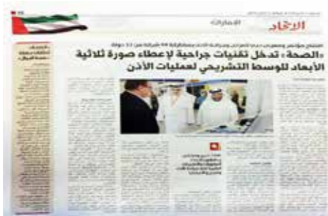
AL ITTIHAD NEWSPAPER Dubai Otology 2016 – Day 1